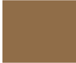
CIGAR No. 941