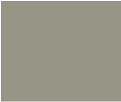
SLATE GRAY No. 922 (pre-mixed color)