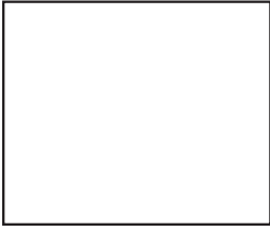
SIMPLY WHITE No. 930