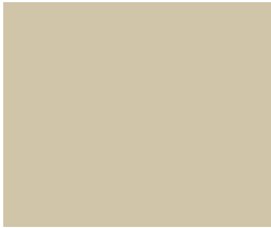
TAUPE No. 925