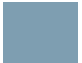
BLUE RIDGE No. 929

NOTE: Color is affected by light, heat, age, condition of surface, application method and/or printing limitations. Some variation in color will occur between printed material, sample chip and finished coating. Computer monitors display color differently than printed pieces. For best results when using more than 1 gallon, mix all paint together before application. Two coats are recommended (see directions).