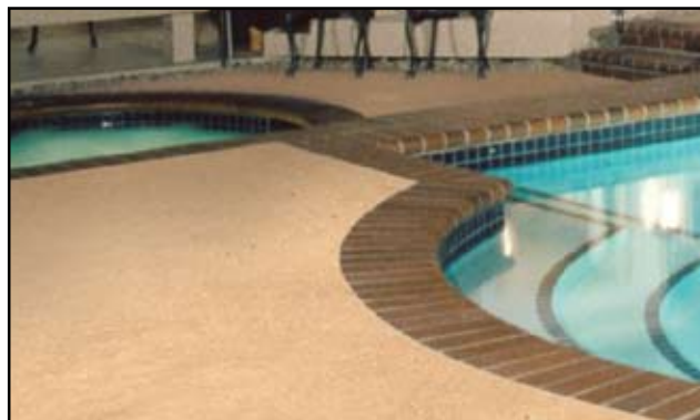
...Into a Decorative Living Space